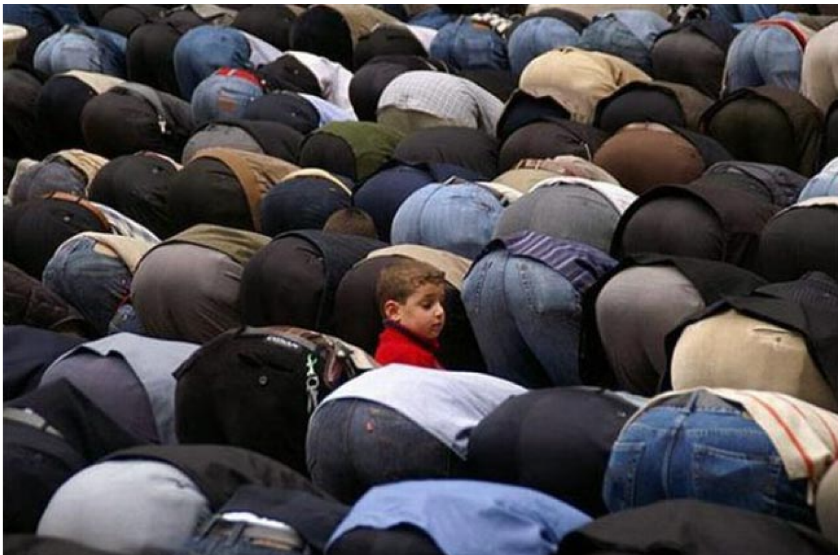
within the crowd, one person isn't praying the same