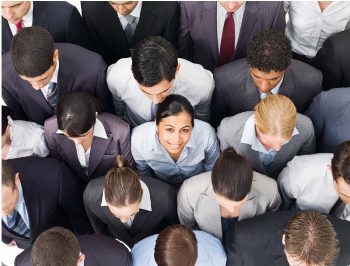
within the crowd, one person looks up